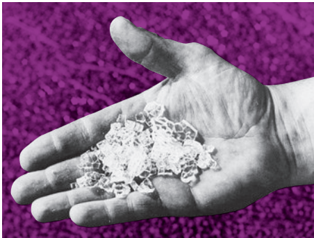
If toughened glass breaks, it shatters into relatively harmless small granules.